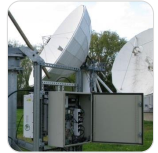
ODE-B at a SatCom facility

The ODE-B is a 600mm x 600mm x 220mm steel enclosure with an ingress protection rating of IP66. Designed to supporting the need for service equipment to be housed as close to the antenna as possible, this unit can accommodate up to eight ViaLite OEM fibre optic modules plus multiple ancillary modules and customer equipment such as dual power supplies , RF switching and bias-T's. The ODE-B is a versatile enclosure widely used in installations such teleports, earth stations and in the marine industry.