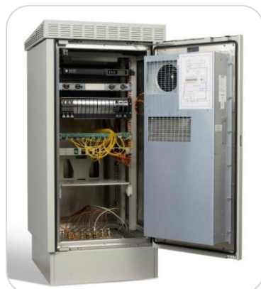
Air-conditioned ODE-D+ enclosure

The ViaLite ODE-D series of free-standing, outdoor steel cabinets provide 25U of 19" rack space with an ingress protection rating of IP55 to house RF over fibre and customer equipment. The external dimensions are 1550 x 850 x 725mm. The ODE-D+ incorporates air conditioning. The enclosure design provides easy access to the installed equipment via the front, rear and also the top.