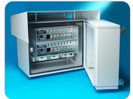
Connectivity at the rear of the ODE-C

Network Operators and Service Providers rely on the ODE-C to centrally house ViaLite Fibre Optic 19" rack equipment at outdoor sites such as metro locations or service tunnels.