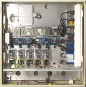
ODE-B – with five modules plus integrated power & RF switching

Using the ViaLite ODE-B to integrate Passive Optical Network (PON) components such as optical splitters, tap-couplers and Optical Add/Drop Multiplexers (OADMs), it is possible to distribute services over a number of remote sites in 'star' or 'chain' type networks. The ODE-B is typically used together with ViaLite 19" rack based equipment installed in control rooms. Together these form a complete optical subsystem for communication links.